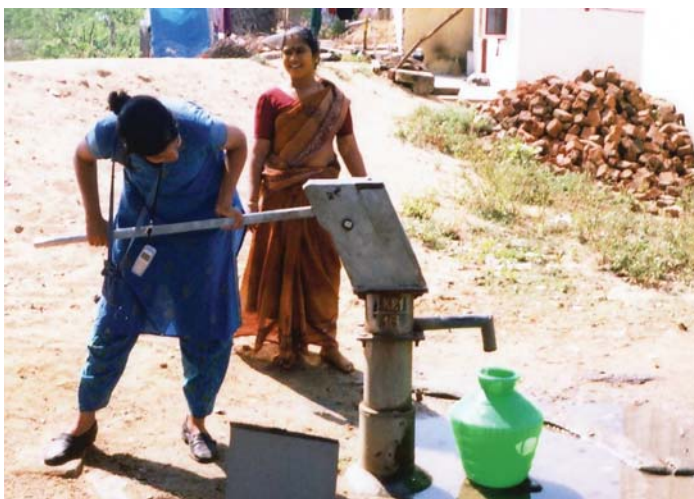
There are more than 420,000 wells in Chennai.

Lessons Learned from Mexico and India: We gained three valuable insights from our work in India and Mexico. First, water supplies in developing regions are on the vulnerable edge of sustainability, because people tend to forget past water crises. In other words, when droughts end, the incentive for dealing with future supply problems disappears. Second, central water managers have been ineffective in addressing water crises. Third, integrated predictive models enable policymakers to better manage future crises.