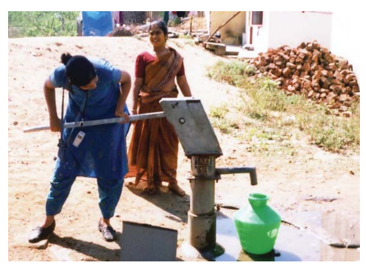
There are more than 420,000 wells in Chennai.

Lessons Learned from Mexico and India: We gained three valuable insights from our work in India and Mexico. First, water supplies in developing regions are on the vulnerable edge of sustainability, because people tend to forget past water crises. In other words, when droughts end, the incentive for dealing with future supply problems disappears. Second, central water managers have been ineffective in addressing water crises. Third, integrated predictive models enable policymakers to better manage future crises.