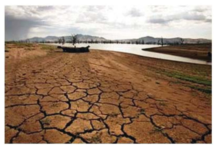
Severe drought is plaguing many locations around the world like here in Australia.

Here in the arid western United States, we are no strangers to drought. However, with effective institutions and good infrastructure, we have, for the most part, managed to limit economic losses during times of drought and preserve critical ecosystem functions.